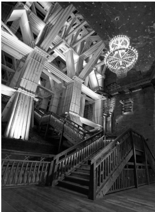
Fig. 1. Grating casing in Michałowice chamber

A periodic monitoring of measurable parameters is a justified method for indication of the status of an interaction between a wooden casing and a rock formation in the course of its use, particularly in the context of: