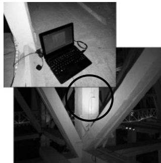
Fig. 3. Readout of the results from one of the recorders in the chamber Drozdowice III

In conclusion, the gratings selected in the two chambers differ in construction (side spread), period of exploitation / functioning and history of protective measures applied in the chamber. In both cases the focus was placed on the measurement of load-bearing pillars and measuring of frames on storeys I and II. A part of the measuring points is located at sites inaccessible in the conduct of regular preventive measures – measuring recorders at these sites were fitted using climbing techniques (Fig. 3, 4). Measurements began in January 2014.