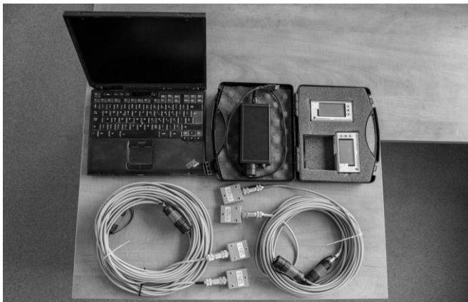
Fig. 2. Subassemblies of the measurement system: recorders with wires (permanent and inspection type) power module and laptop